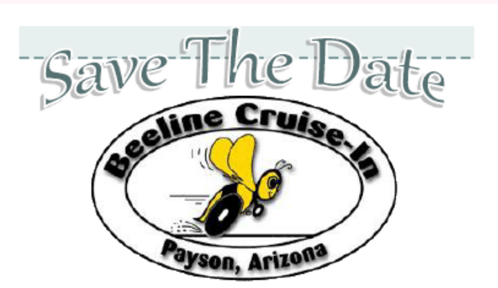
October 8th & 9th 2021 On-line registration available by July 1st http://clubs.hemmings.com/rccac/